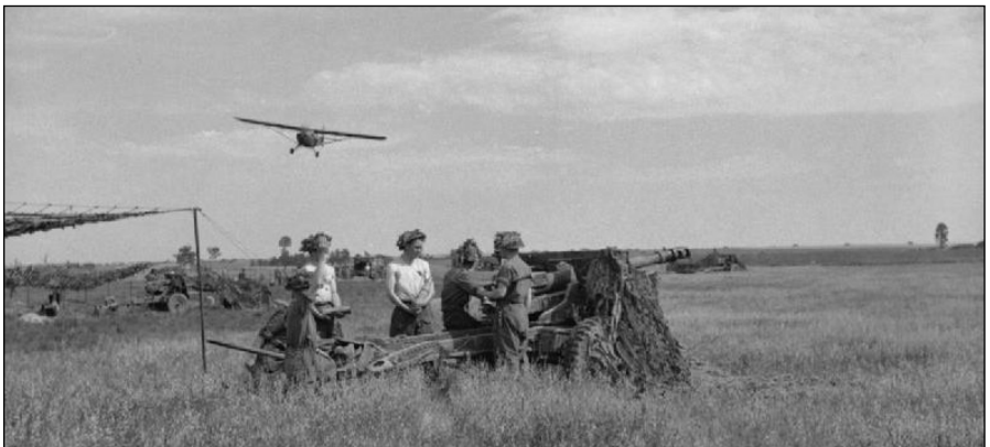
6 July 1944, QF 25 pdr anti-tank gun defending B 10 aerodrome AOP Auster of 652 Sqn RAF approaching

The Polish Air Force Memorial Committee is particularly pleased to welcome representatives of the Commune of Plumetot and its neighbourhood to today's Commemoration. Polish, French and British interests are combined to mark an important part of our shared history.