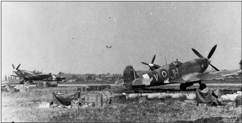
Polish Spitfire IXc's of 317 Sqn in their dispersal areas at B10 Plumetot