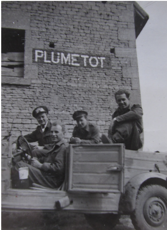
Polish airmen using captured enemy transport

The arrival of 131 Polish Wing at Plumetot has a particular significance as it marked the return of the Polish Air Force to mainland Europe.