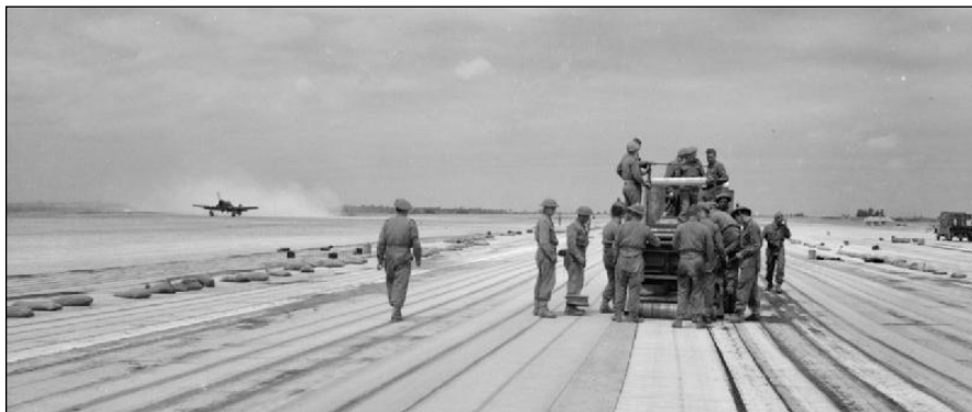
Soldiers of the Pioneer Corps laying prefabricated bitumen strips for a new runway at B10/Plumetot, as a Hawker Typhoon of 198 Sqn RAF takes off

well remembers being a five-year old boy taking fresh milk from the family farm to Polish pilots and returning with his pockets full of sweets.